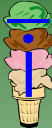
i ce cream